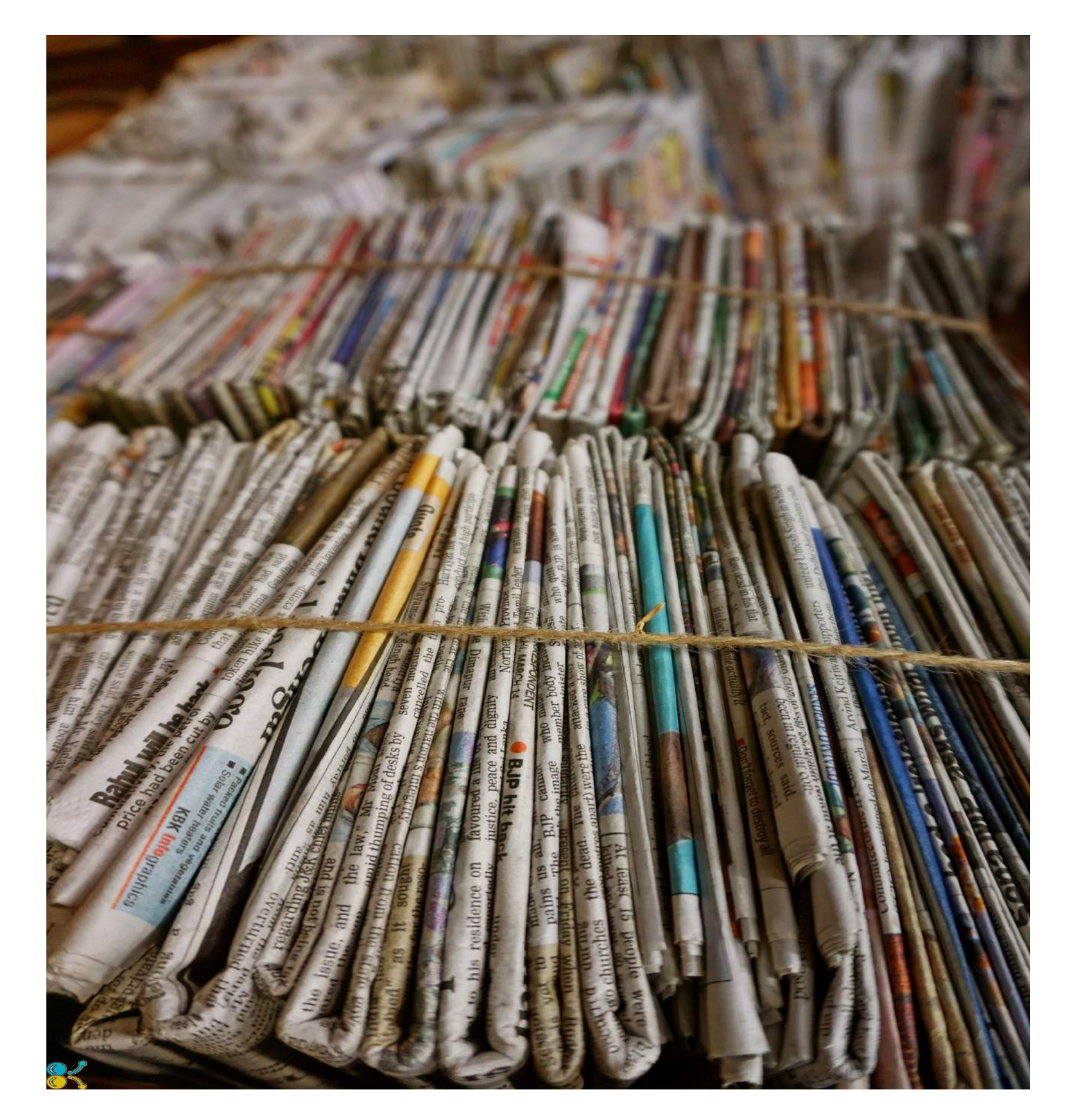
Digital investigations in an era of data-driven journalism